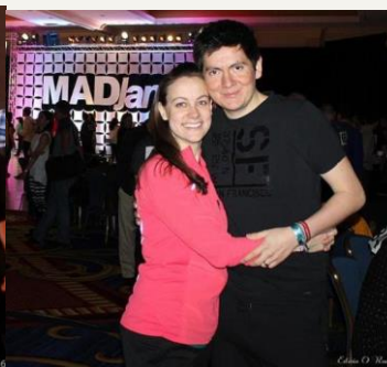
Best oopsie moment of the weekend!